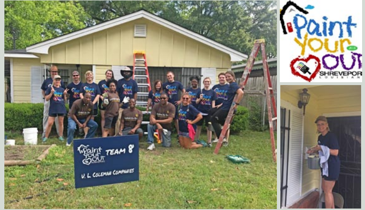
The U. L. Coleman and UPS teams worked together to help paint a home in the Cedar Grove Neighborhood.

Paint Your Heart Out Shreveport once again brought more than 1,000 enthusiastic volunteers from local businesses, churches, and organizations to donate their time to help out homeowners whose homes could use a little TLC. “Paint Your Heart Out Shreveport”, is an annual event that gives back to homeowners in need.